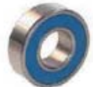
6202-2RS 5/8" C3

Dim.: 15mm ID x 35mm OD x 11mm W Replaces: Hitachi 6202NC; Isuzu 8-94223-980-0 Note: w/ 2 Tolerance Rings on OD