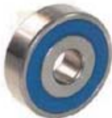
6203-2RS d12 C3

Dim: 5/8" ID x 40mm OD x 12mm W Note: Used in industrial machinery applications