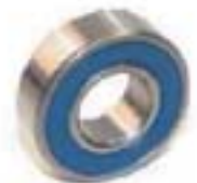
6202-2RS d16 C3

Dim.: 5/8" ID x 35mm OD x 11mm W Note: Used in industrial machinery applications