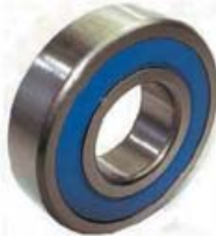
6306-2RS d32 C3

Dim.: 25mm ID x 72mm OD x 19mm W Replaces: Mitsubishi S930P81170 Note: Used in Mitsubishi alternator# A4TU3699