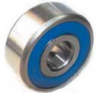
62304-2RS d17 C3

Dim.: 17mm ID x 47mm OD x 19mm W Replaces: Fiat 24940240, 24940260; Mitsubishi S930P70170