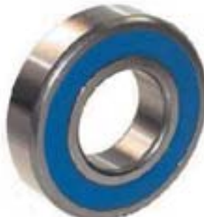
6206-2RS d20 C3

Dim.: 1" ID x 52mm OD x 15mm W Note: Used in industrial machinery applications