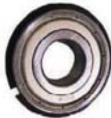
6203-ZZ NR C3

Dim: 12mm ID x 40mm OD x 12mm W Note: Used in industrial machinery applications