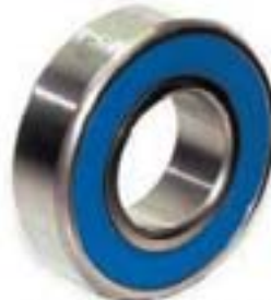
6205-2RS d1 C3

Dim.: 25mm ID x 52mm OD x 13mm W Replaces: NTN SC05A5ICS24