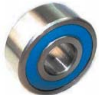
62304-2RS d20 C3

Dim.: 17mm ID x 52mm OD x 21mm W Replaces: Bosch 1-120-905-005, 1-120-905-103