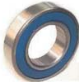
6006-2RS d32 C3

Dim.: 20mm ID x 42mm OD x 12mm W Note: w/2 Tolerance Rings in ID Used in Mitsubishi starters on Ford 7.3L Diesel Engines (Mitsubishi unit# M8T50071, M8T50171, M8T50172)