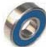
6201-2RS 1/2" C3

Dim.: 12mm ID x 40mm OD x 12mm W Note: Open bearing. Fits scooter engines. Pairs with 98305