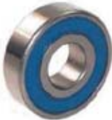
6203-2RS 5/8" C3

Dim: 17mm ID x 40mm OD x 10mm W Note: Used in scooter engines