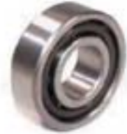
6202 SR C3

Dim.: 12.7mm ID x 32mm OD x 10mm W Note: Used in industrial machinery applications